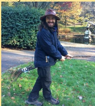
Wizard travelled to Rally on homemade broom. What's his secret? Find out in today's Witch Magazine Broom Guide