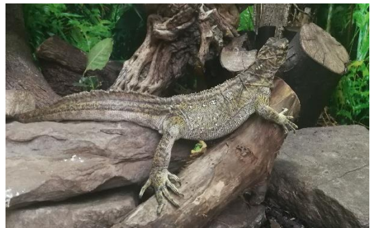
The only real (sorry Pendragon) dragon spotted all weekend!

Others headed out for the whole day. We had some visit Sandcastles Water Park, the UK's largest indoor waterpark. Rumour has it SSAGO members swim as well as mermaids! A group enjoyed Blackpool Zoo, and even saw a dragon.