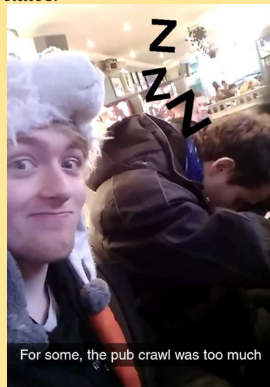
For some, the pub crawl was too much