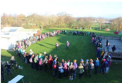
Knights of the not-so-round table

Some of the knights headed to the exotic lands of Lancaster to the west. They had the morning to recover Pendragon's hidden jewels from Williamson Park. Teams were required to hunt for items, such as a book or ring, and take the silliest posed photo. Like every rally, any members who weren't on this quest were very confused when these mysterious and peculiar photos were posted online. The winning team is to be announced later today at the closing ceremony.