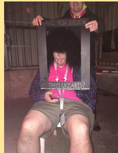
Wanted: Frizzy haired male, believed to have last been seen with high powered associates.