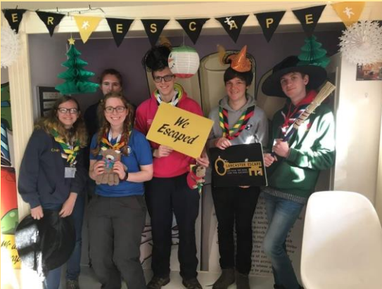
Brave adventurers after escaping a horrible fate