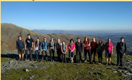
Only the most committed of knights made it to the end of the trail.