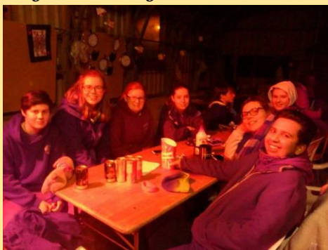
Pub Quiz Winners