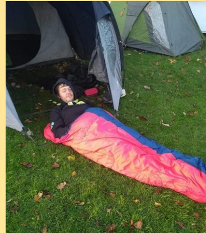
Weary traveller left unable to stand after Friday night's escapades.