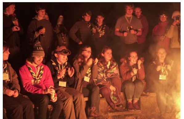
Campfire was lit.

the welsh minibus is dragon out their bed time