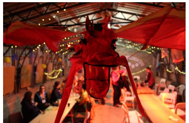
Guess this is toothless?