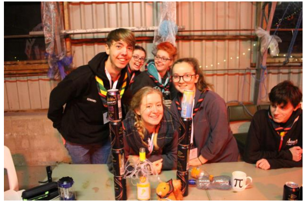
Lord of the (beer) Rings- The Two Towers