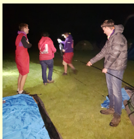
HUGGaS assemble tents in full Roman attire!