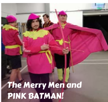
The Merry Men and PINK BATMAN!

BUT THEN! They had to dive in heroically (like Perseus slaying Medusa) to assist with a car crash (allegedly). It's said they intended to save the the victim until he cried "Nah, I'm good thanks" from his heated car. They rounded the trip off by playing a game of 'That's Not My Minibus', which is like 'I Spy' but with miserable life lessons.