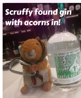
Scruffy found gin with acorns in!

ELECTION EXIT POLL Experts are predicting a 48/52 split on the 'SSAGO Means SSAGO' votes. Join us for live coverage at the AGM.